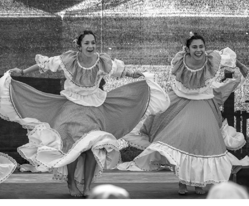
↑ p. 39: Stage programme at the Intercultural Street Festival in 2022