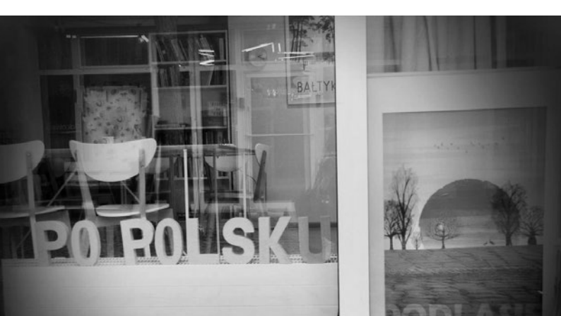
↑ p. 36: Po polsku. Polish language centre | Photograph: Magda Kurpiewska