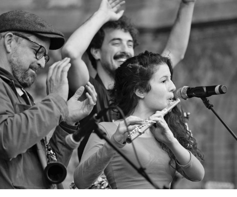
Banda Comunale at the closing ceremony for the 32nd Intercultural Days