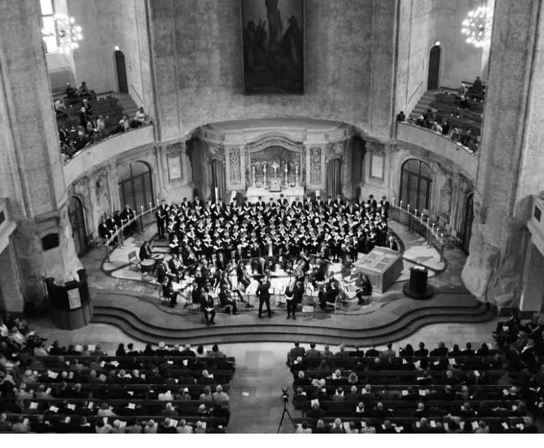
↑ p. 20: Kreuzchor choir at vespers in the Kreuzkirche