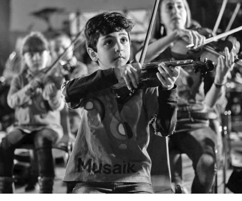
↑ p. 40: MUSAIK – Quest for our roots | Photograph: Martín Rebaza Ponce de León