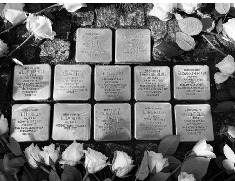
↑ p. 28: Stumbling stones of the Blum family

7.30 – Kulturhafen Dresden, Leisniger Straße 53 9.30 p.m. Improvisational crime story Theatre A murder in your neighbourhood. The whole case is improvised. The audience determines the setting, the characters and the victim and we let the entire play develop from this. Entrance fee: 20 Euro, reduced: 12 Euro Organised by: Kulturhafen Dresden