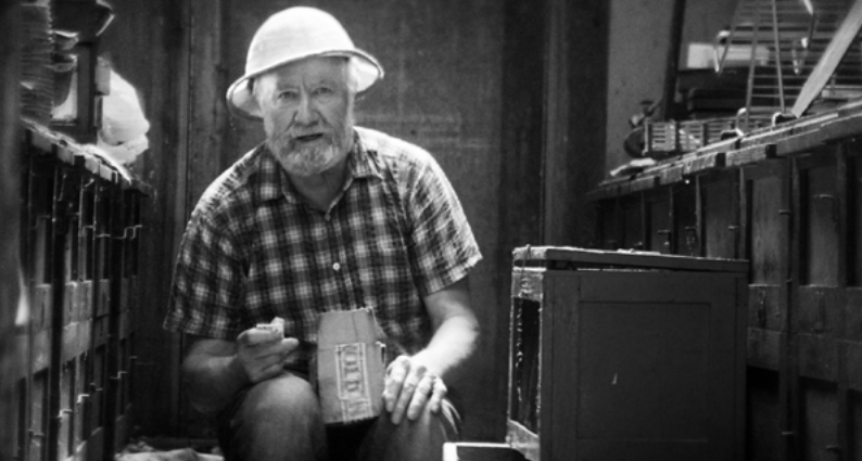
Scene from 'We call her Hanka'